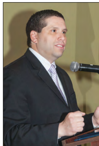
State Senator Sal DiDomenico.